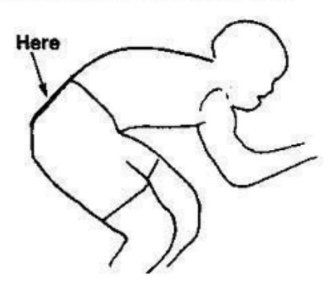
NO TIME MAY BE RECORDED IF NUMBER IS NOT CORRECTLY POSITIONED

CTT REGULATION: ALL RIDERS MUST START WITH BOTH A WORKING FRONT AND REAR LIGHT ATTACHED TO THEIR MACHINE